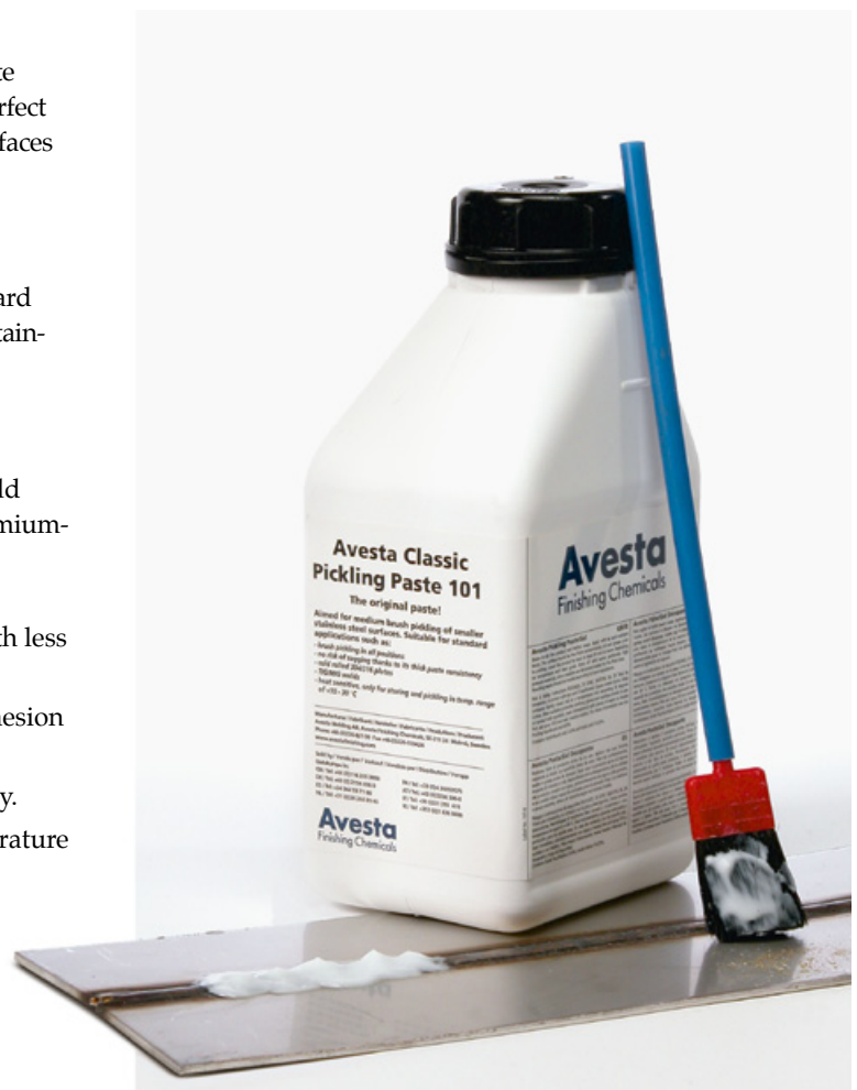
Avesta Pickling Paste 101 – the only real paste on the market.